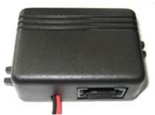
Figure 1. Module appearance.

If there is no sound after installation and assembly of the optical ring, you must reset the head unit by pressing and long holding (more than 8 seconds) power button "On" command.